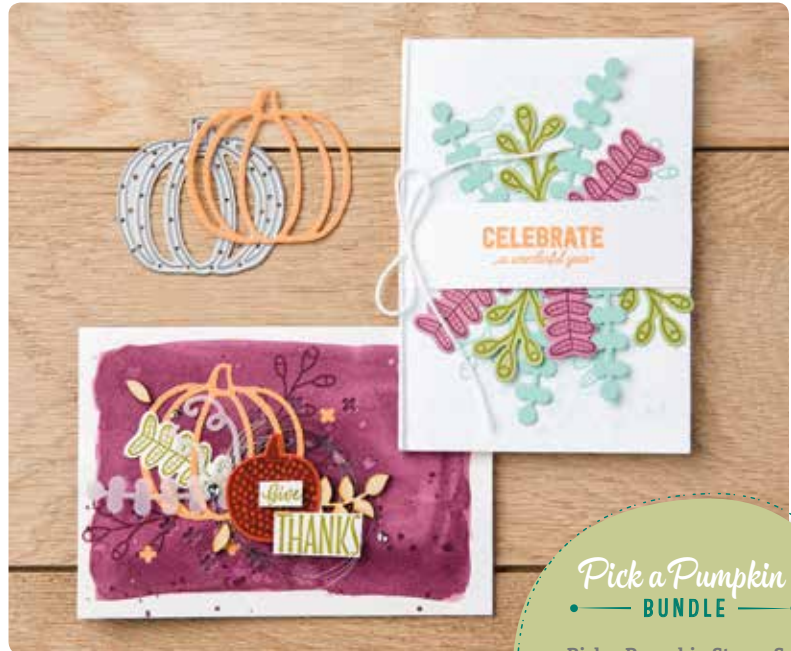
These samples also use the Labels to Love Stamp Set (p. 45).